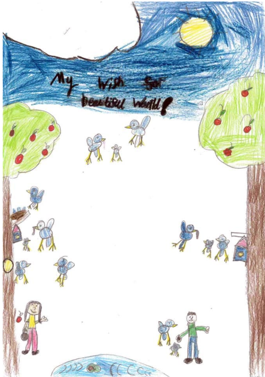
My wish for a beautiful world, sent to Green Santa 2020